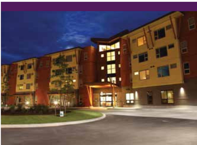
TS'I'TS'UWATUL' LELUM (DUNCAN) PROVIDES AFFORDABLE HOUSING SPECIFICALLY DESIGNED FOR INDIGENOUS ELDER AND PERSONS WITH DISABILITIES.

Given the urgent need to address homelessness in B.C. communities, Budget 2018 builds on this successful program with funding for an additional 2,500 new homes with 24/7 support for people who are homeless or at risk of homelessness.