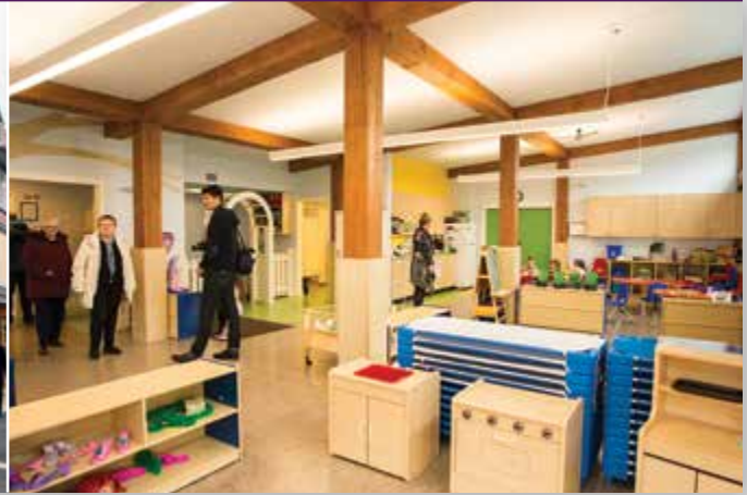
ABOVE: ROSALIE'S VILLAGE PROVIDES AFFORDABLE HOUSING AND DAYCARE FOR SINGLE MOTHERS FLEEING VIOLENCE.

Recognizing historically low vacancy rates and historically high home prices, the Province is investing $378 million over three years and more than $1.8 billion over the next 10 years in rental housing to improve housing choices for middle income British Columbians, including seniors and families.