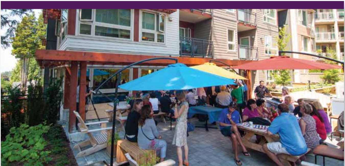
HYAD PLACE (NORTH VANCOUVER) PROVIDES RESIDENTIAL APARTMENTS FOR ADULTS WITH DEVELOPMENTAL DISABILITIES.