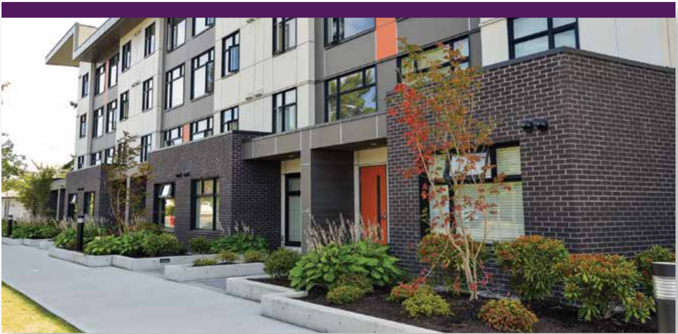
ABOVE AND BELOW: DAHLI PLACE (VICTORIA) PROVIDES AFFORDABLE RENTAL HOUSING.

increased monthly benefits, including 3,200 newly eligible seniors and families.