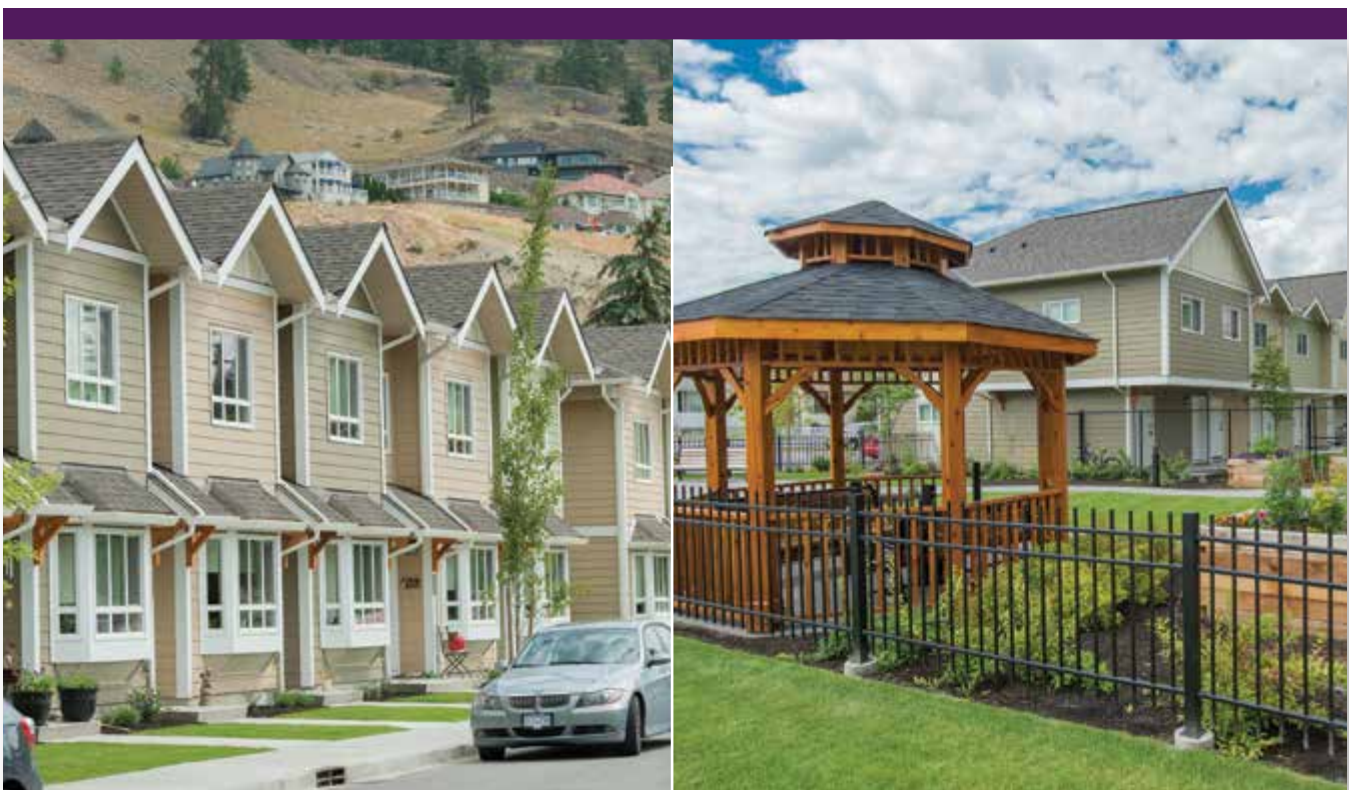
LEFT AND RIGHT: PLEASANTVALE (KELOWNA) PROVIDES AFFORDABLE HOUSING UNITS FOR SENIORS AND TOWNHOMES FOR FAMILIES.

These investments will also lower carbon emissions, and cut energy costs for non-profit providers and residents alike.